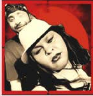
BY HIPPIE MANDY & KD-SMOOVE